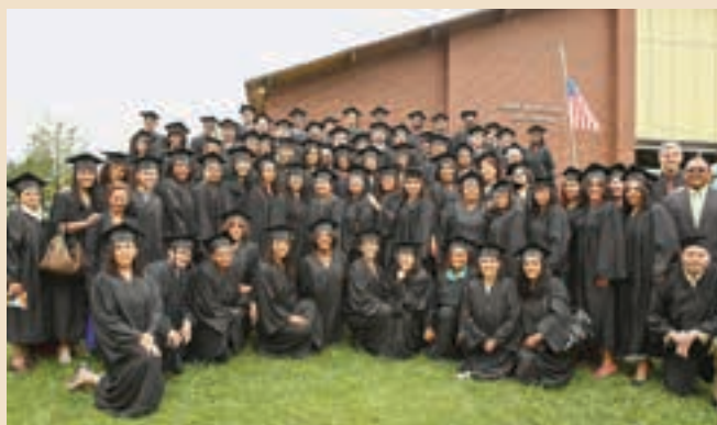
Graduates following the graduation ceremony where they received their Bible Worker certificates.

as part of the NY13 Revelation of Hope initiative. The project began with 150 students, and the most