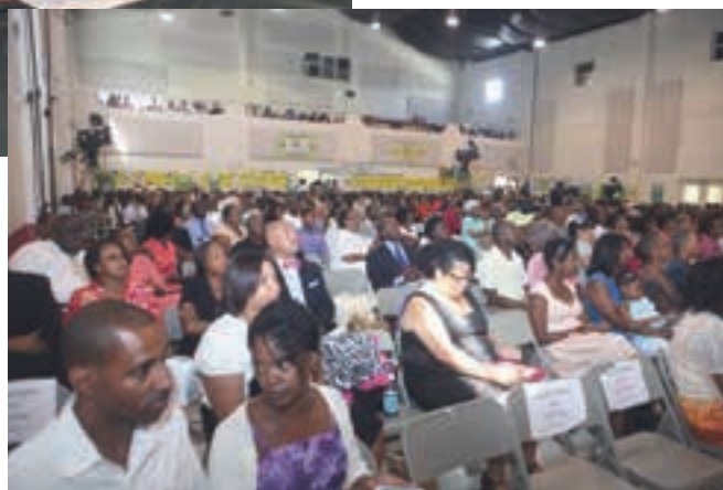
People fill the Bermuda Institute auditorium for the Breath of Life Summer Revival meetings.

The embodiment of the conference's mission statement, "To reach every person, family, and group in Bermuda with the distinctive Christ-centered, global, Seventh-day Adventist message of hope and wholeness" was evident as hundreds of people streamed in to the Bermuda Institute auditorium to worship, praise, hear the Word of God and learn of His plan for their lives. One of the opening night attractions was world-renowned singer Larnelle Harris, who drew many people from diverse walks of life.