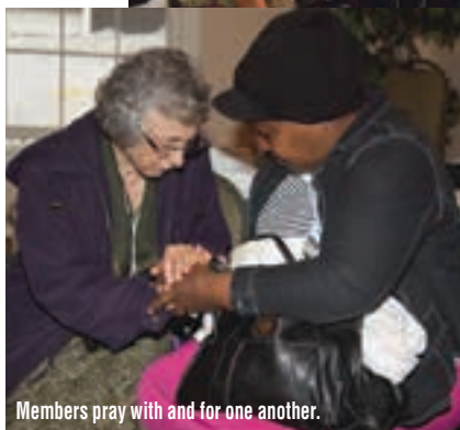
Members pray with and for one another.

A highlight of the event was the agape Communion service on Sabbath afternoon. Participants were asked to get out of their comfort zones and wash the feet of someone they didn't know. By doing this, they got to know someone with whom they otherwise might not have talked. An agape meal and testimonies