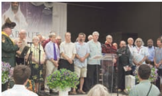
Northern New England Conference Pathfinders honor veterans during a program on Sabbath afternoon.