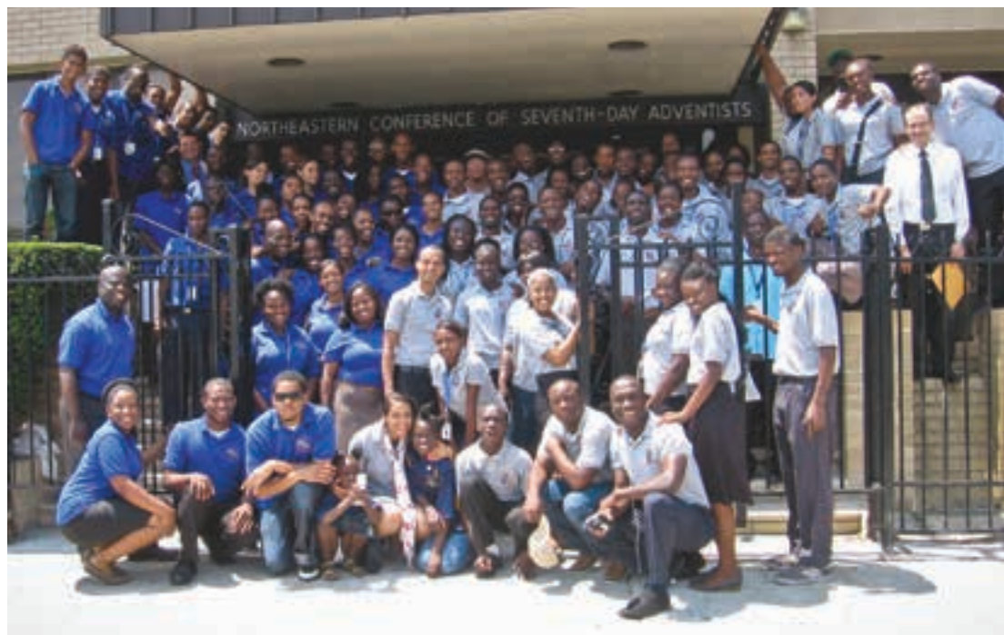
Students from Oakwood University, Andrews University, Washington Adventist University, and other colleges and universities who participated in literature ministry in Metro New York City during the summer.

As of July 6, 449,800 homes have been visited and 4,900 individuals have requested Bible stud-