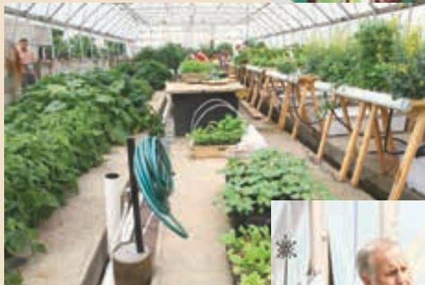
The greenhouse will provide nutritious food to the students while offering work opportunities that will help some with tuition expenses.

Academy provided a good match. She secured a grant through the Allyn Foundation, and this enabled the work on the