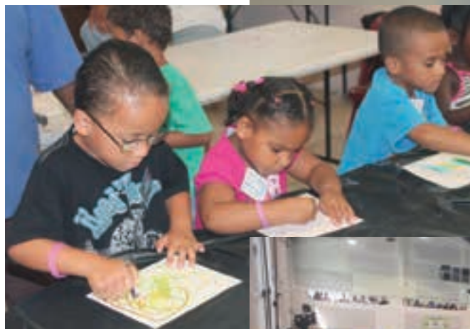
The children participate in the "I Believe" program.