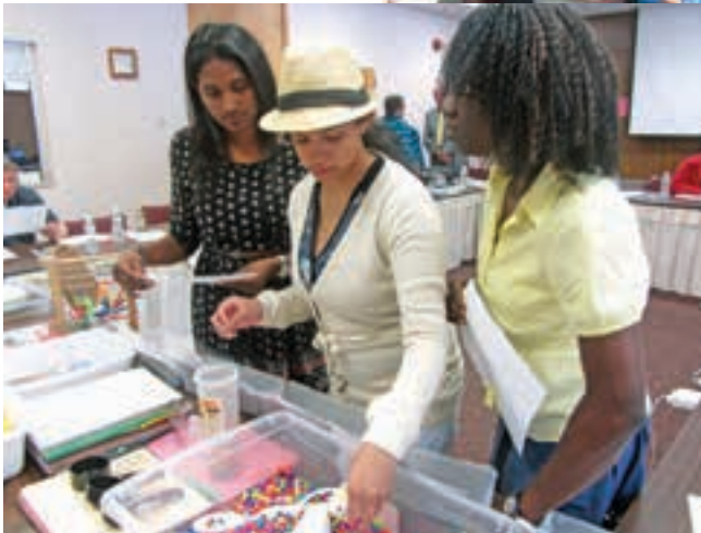
Several of the teachers work together on different projects during orientation.

against blood borne pathogens, how to incorporate NAD standards, and the goals of Adventist education in their lesson plans. Teachers were coached in the use of the REACH