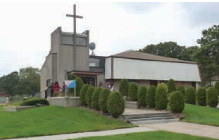
Bethesda church in Amityville, New York.